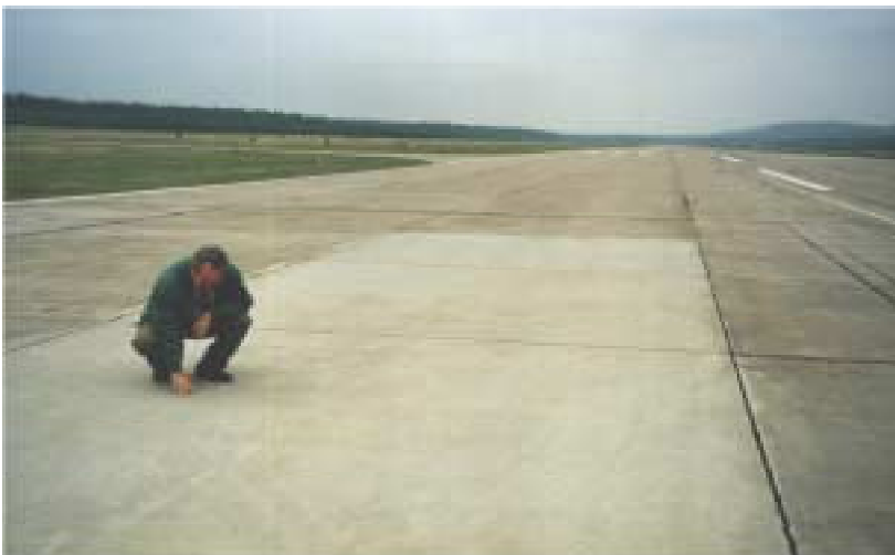
Figure 5. Thin concrete overlay (inlay) Hultsfreds airport done 1994, inspection 1999.