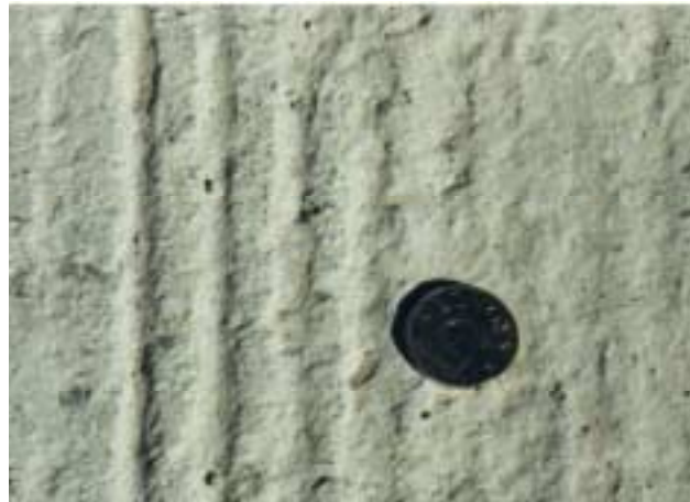
Figure 3. Surface after milling

Depending on the area for the repair work different milling machine can be used. It is important that when using an asphalt milling machine with high capacity the following cleanliness procedure should be adopted to a very high water pressure blasting (800-900 bars, see point 2). For small areas a handhold-milling machine can be used. Good results has been achieved with milling depth from 10-35 mm.