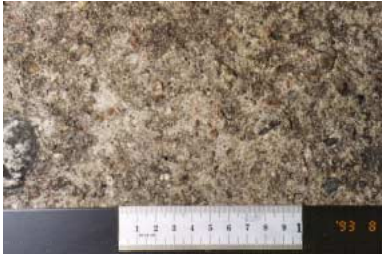
Figure 2. Frost damage area due to scaling.

The airfield pavement area in focus is often damaged by frost scaling see figure 2. Investigation on the damage area and the depth of damage concrete should always be done by for example thin section analysis. The principle method consists of several steps and can also be divided into two categories of repair equipment methods. One is for greater areas and one for small areas but the principle is the same only the equipment differs from the two categories.