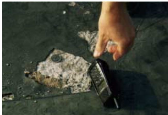
Figure 1. Unsuitable material for thin concrete layer.

Today there exist various methods and material for thin concrete overlays or inlays. Unfortunately many materials are not comparable with the existing concrete pavements, especially material with densely structure. Figure 1 show onee type of material that after two or three years come completely loose. This type of material is not suitable for concrete pavement used for airplane traffic due to the high risk of motor damage. We started to study the use of thin concrete overlays in 1991. The first use of thin concrete overlays was a concrete motorway with rutting depth of 13-15 mm due to the use of studded tyres. The result was a susses \1\ the bond between the new top layer and the bottom concrete was very god.